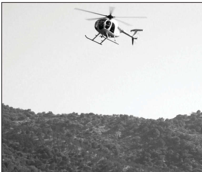
ON THURSDAY, JULY 1, a helicopter hovered over the Middle Fork of the Kaweah River to search for a missing amateur rafter.